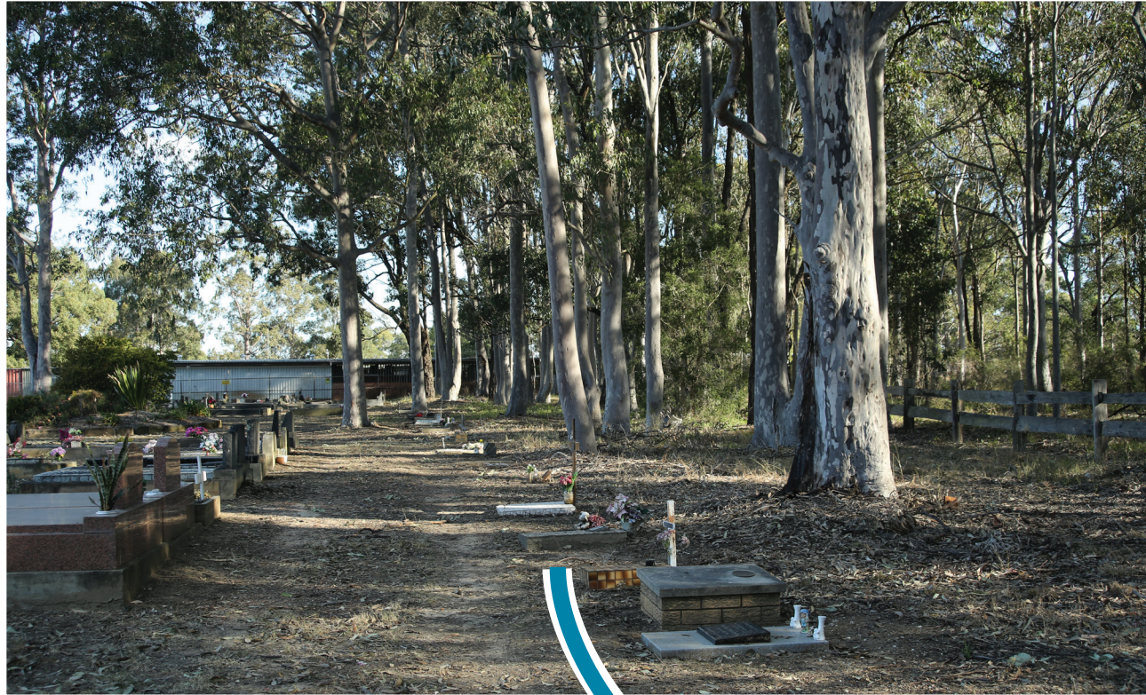
Existing view of Cessnock Cemetery