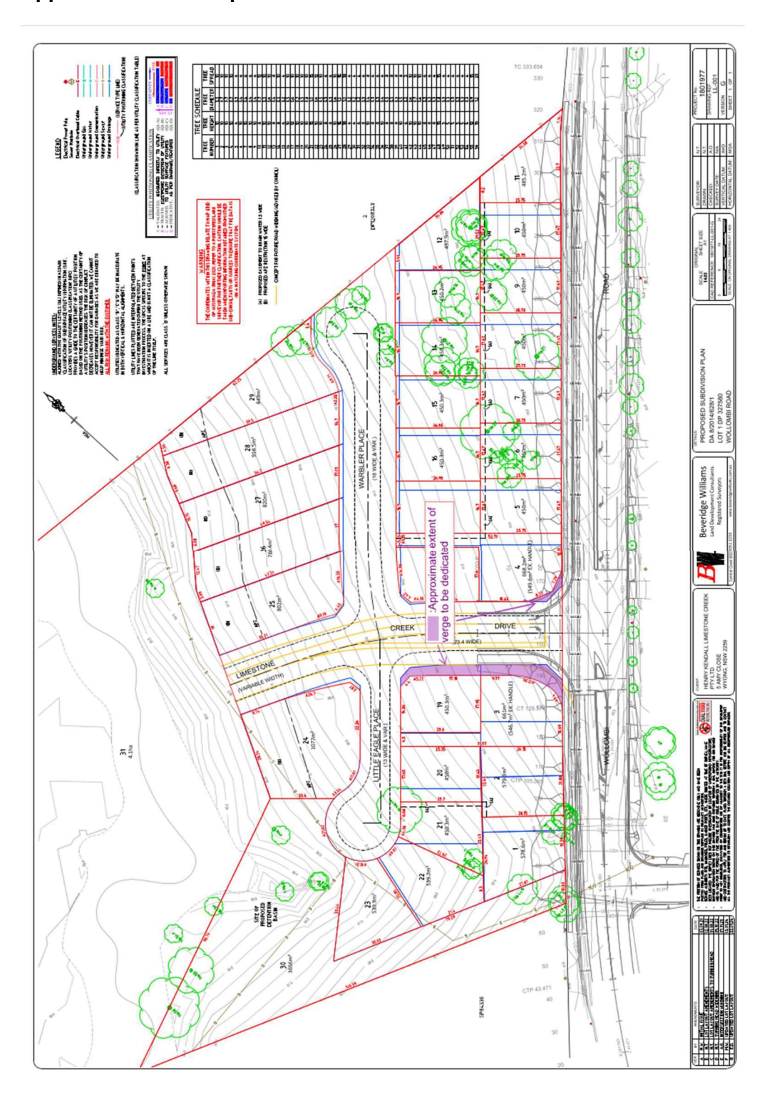
Appendix B – Development