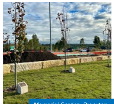
Memorial Garden, Branxton

Central to the garden's design are 10 deciduous ornamental pear trees, each representing a life lost in the tragedy. Alongside these trees are individual memorial plaques, displaying heartfelt messages provided by the families.