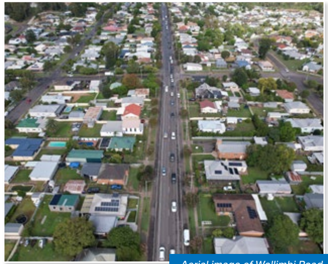
Aerial image of Wollombi Road.

www.cessnock.nsw.gov.au/WollombiRoadUpgrades .