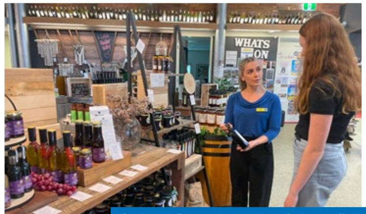
Our Launch Program has a variety of roles on offer!