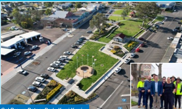
Col Brown Rotary Park, Kurri Kurri.

Cessnock City Council was delighted to mark the completion of the $6 million upgrades to Kurri Kurri Town Centre and Col Brown Rotary