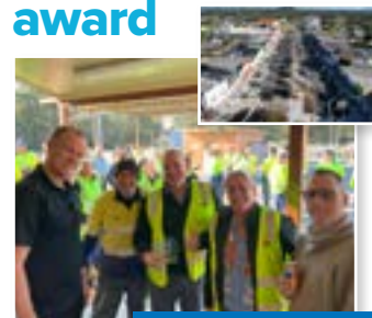
Celebrating the win

Cessnock City Council recently won the award for the Best Infrastructure Project over $1.5 million at the Local Government Professionals Awards, recognising the Kurri Kurri Town Centre Upgrade.