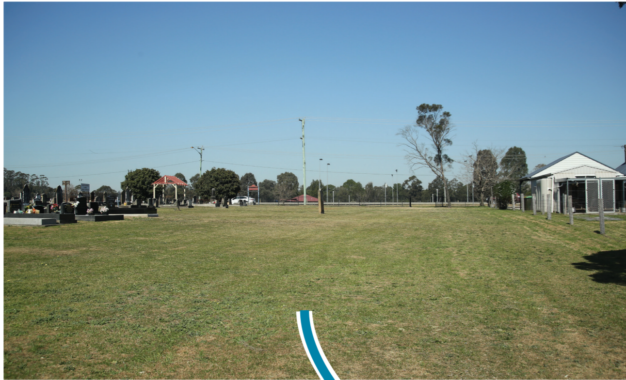
Existing view of Branxton Cemetery