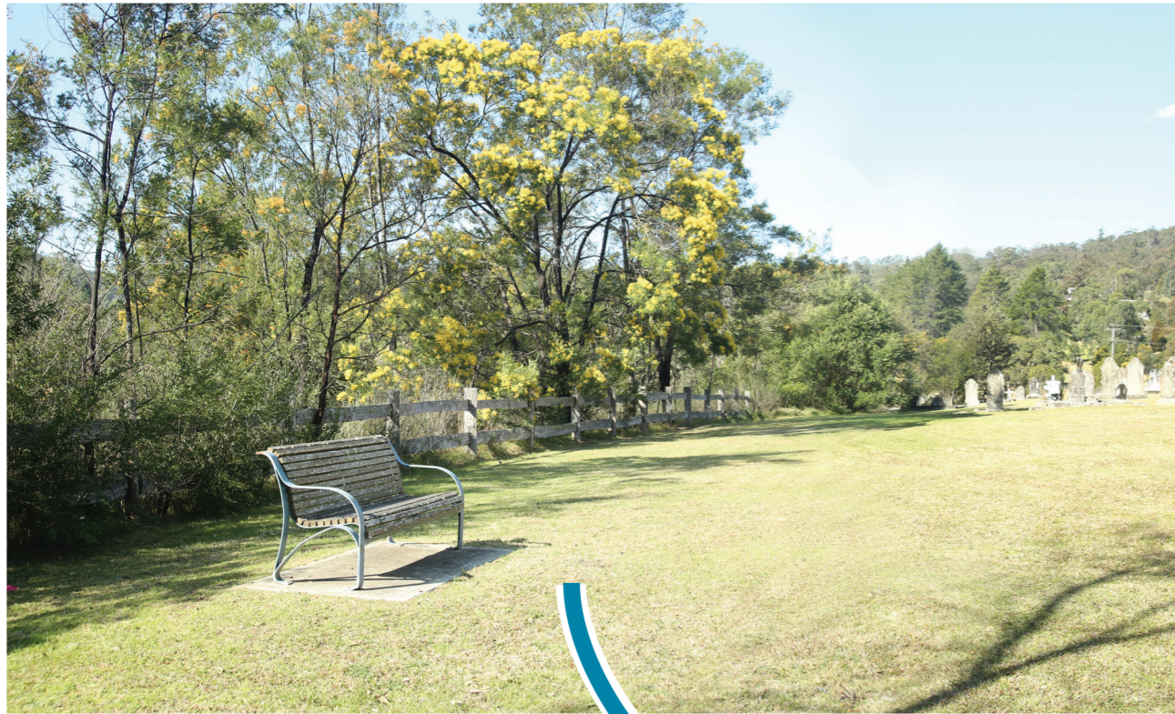
Existing view of Wollombi Cemetery